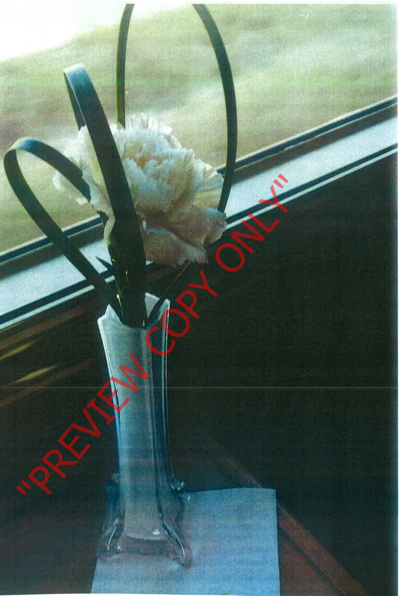
Rooms vase (Specimen)