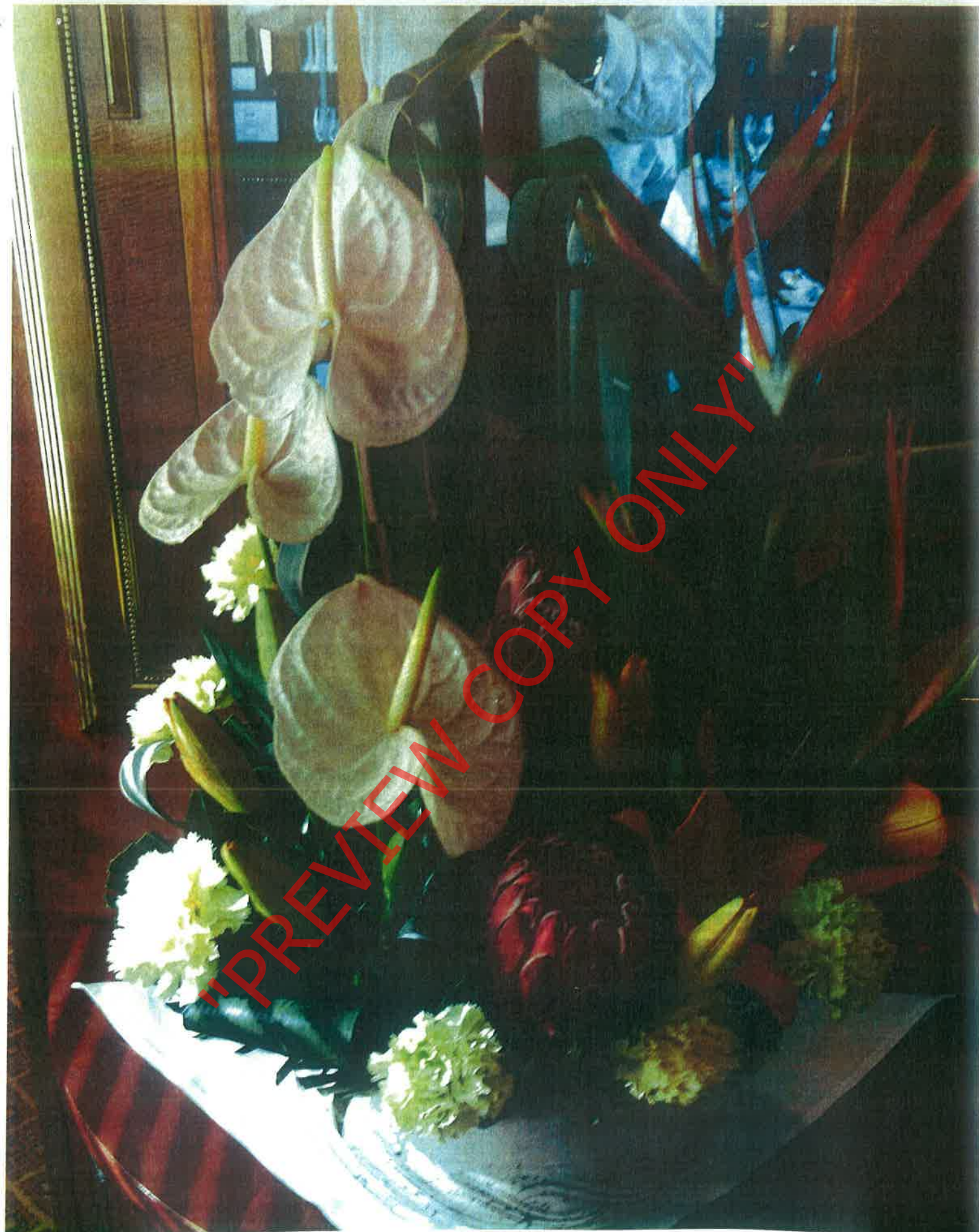
Dining Car - Medium Arrangement