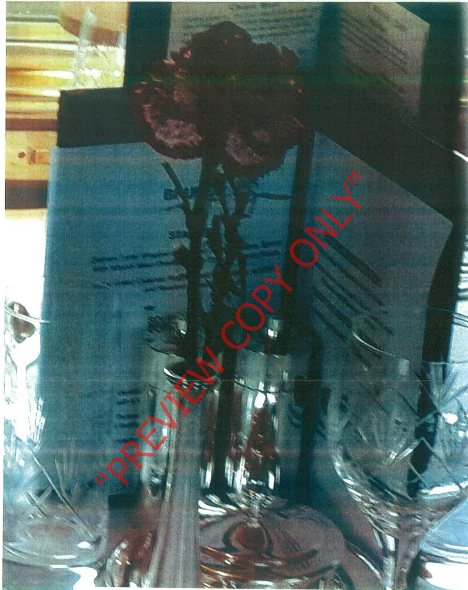
Dining Car Table -vase (Specimen)