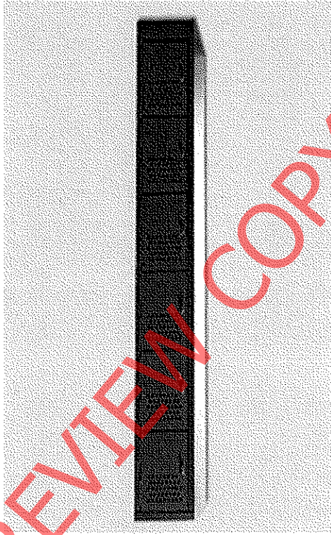
BP06 - 6 Tier Factory Steel Locker

6 Tier Factory Steel Locker, Colour: Ivory Karoo or Hammettana Grey, Height: 1800mm, Width: 305mm, Depth: 450mm