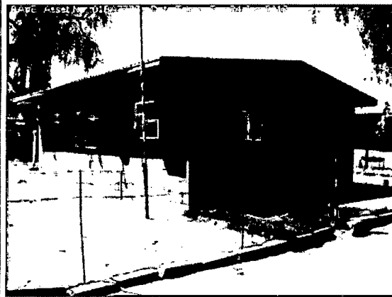
Asset: 01BA777S - View from :Unspecified Date: 24-Jan-2012 File No:15002119 (1/11)