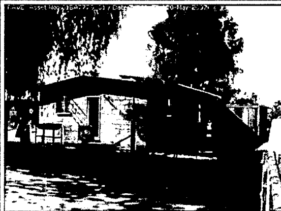
Asset: 01BA777S_01 - View from :45° Left Date: 10-May-2007 File No:10023601 (6/11)