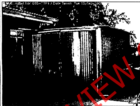
Asset: 01BA777S - View from :45° Left Date: 15-Sep-2009 File No:10035521 (3/11)