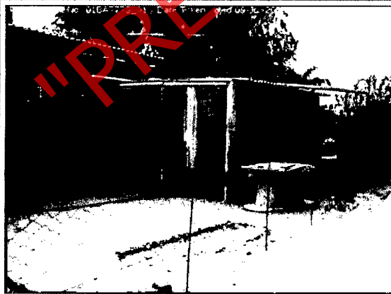
Asset: 01BA777S_01 - View from :45° Left Date: 09-Jul-2008 File No:10028871 (5/11)