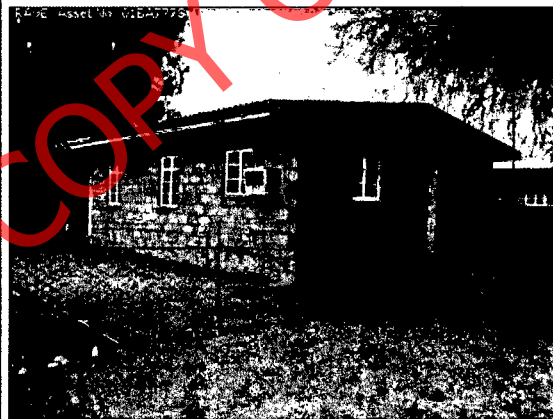
Asset: 01BA777S - View from :45° Left Date: 09-Jul-2008 File No:10028870 (4/11)