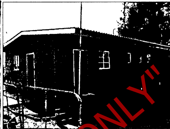
Asset: 01BA777S - View from :45° Right Date: 15-Sep-2009 File No:10035520 (2/11)